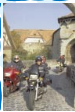
Modern knights pass through the town gate of Rothenburg ob der Tauber.