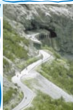
Set the perfect Alpine pace.

122 East 42nd Street, 52nd Floor, New York, NY 10168-0072, USA